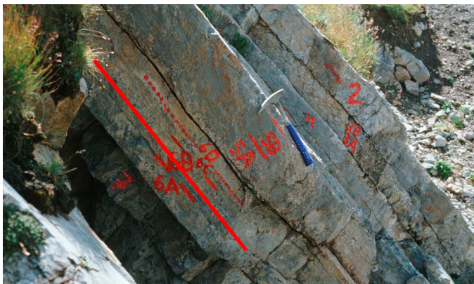
The boundary beds between the Devonian and the Carboniferous Periods.

The name “Green Crest” is derived from the grass-covered slope on the Italian side which consists of shales and sandstones of the Carboniferous Hochwipfel Formation which cut into the limestone sequences of the mountains Cellon and Kolinkofel.