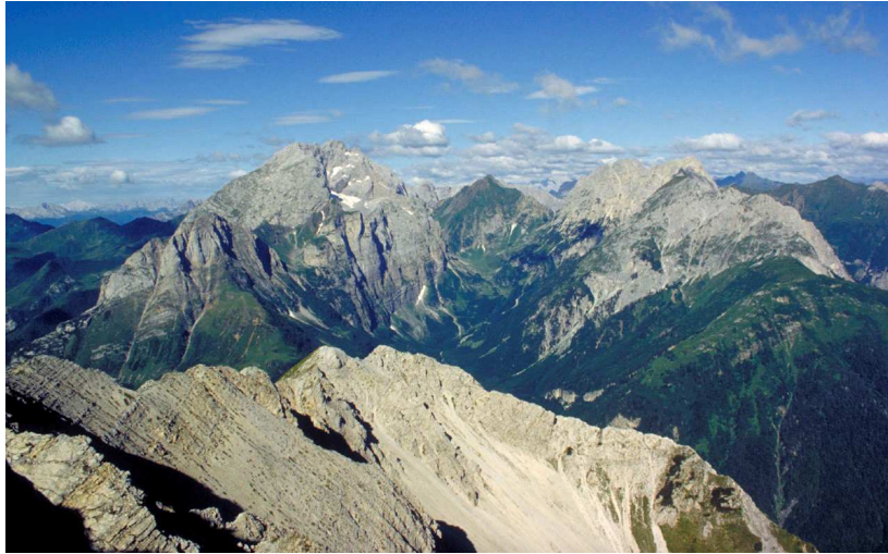
View from the summit of Polinik to northwest with the mountains Cellon, Kolinkofel, Rauchkofel and Gamskofel.

Mountain Polinik with the pyramid-like summit represents the land-